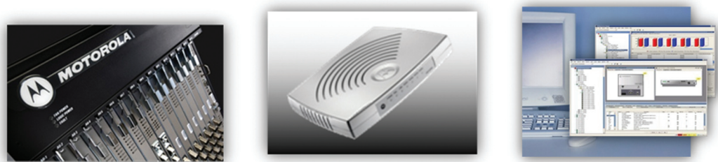
Motorola's AXS1800 Enterprise Aggregation Switch, ONT1120GE Work Group Terminal and AXSvision, System Graphical User Interface

The Fiber Distribution Terminal: Another passive element that requires no power, the Fiber Distribution Terminal distributes the single POL connection from the FDH to area WGTs.